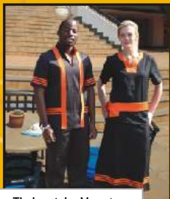
☀️ Thabo style: Mens top. Different colours in stock.