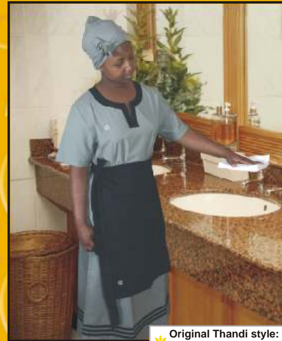
☀️ Original Thandi style: Skirt, blouse, apron & turban. 5 different colours available.