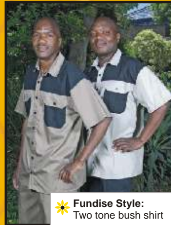
☀️ Fundise Style: Two tone bush shirt