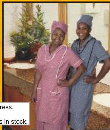
☀️ Jessica style: Dress, apron & turban. 4 different colours in stock.