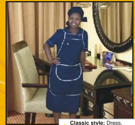
☀️ Classic style: Dress, apron & turban. 5 different colours available