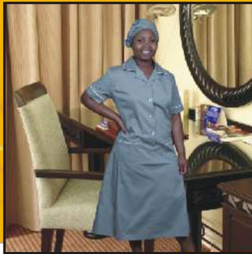
☀️ A-Line style: Dress, apron & turban. 5 different colours available.