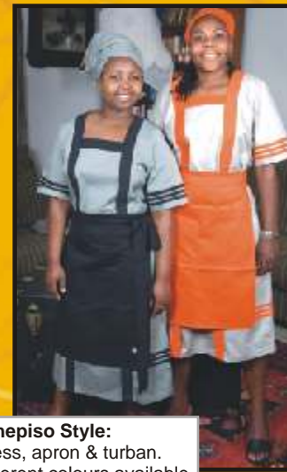
☀️ Tshepiso Style: Dress, apron & turban. Different colours available.