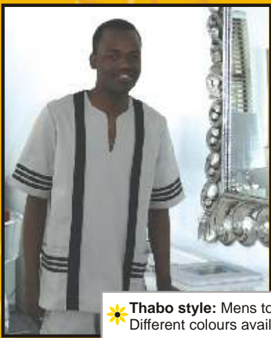
☀️ Thabo style: Mens top. Different colours available.